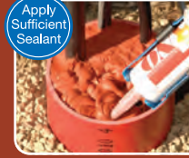
Apply Sufficient Sealant

8. Push sleeves into duct to depth of 20mm, allowing for the application of the NOFIRNO sealant layer.