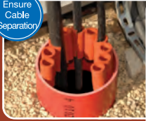
Ensure Cable Separation

4. Place a split sleeve around each of the cables in the duct and then push the multi sleeves into the duct. For larger or single cables, this is not necessary. Simply ensure the multi sleeves provide separation between cables and between the duct and cables.